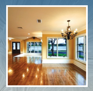
PG County On Call Home Renovations