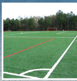
Al Rahmah School Field Construction