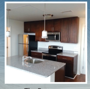
The Patterson Apartments